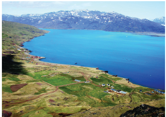
Kujataa, Greenland: Norse and Inuit farming at the edge of the Ice Cap. View of the coastal plain with Qassiarsuk / Brattahlíð.

Kujataa's unique farming traditions have been a determining factor in designating it as world heritage. However, the Danish Risø National Laboratory has estimated that up to a thousand tons of radioactive dust might be released annually from just the Kvanefjeld open pit mine due to material handling, hauling and blasting and from the ore stock and waste rock piles. 14