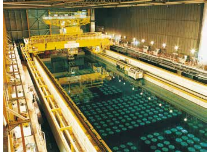
THORP reprocessing plant.

That ‘the highly complex plant failed to operate to its projected standard’ as set by BNFL is beyond doubt. The full impact of these failures on THORP’s profitability will however only be determined by the publication of a final ‘set of accounts’ for the plant. To date, no such figures