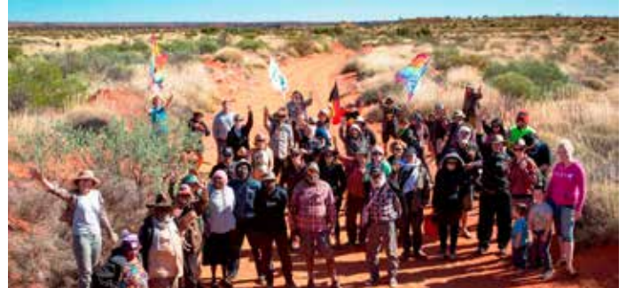
Walk against uranium, Western Australia, 2016.

Globally, 115 nuclear reactors are undergoing decommissioning – double the number under construction. The International Energy Agency is warning about the lack of preparation and funding for a “wave of retirements of ageing nuclear reactors” and an “unprecedented rate of decommissioning”. A growing number of countries are phasing out nuclear power, including Germany, South Korea, Switzerland, Belgium and Taiwan.